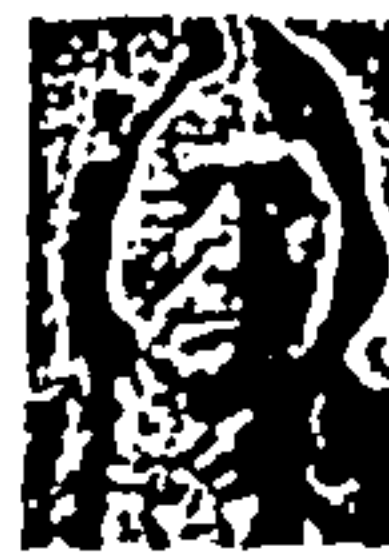
CHIEF BLACK COAL